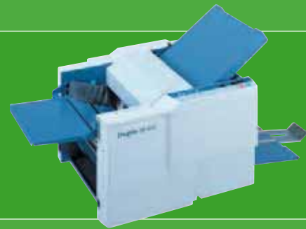
Automatic Folder DF-915