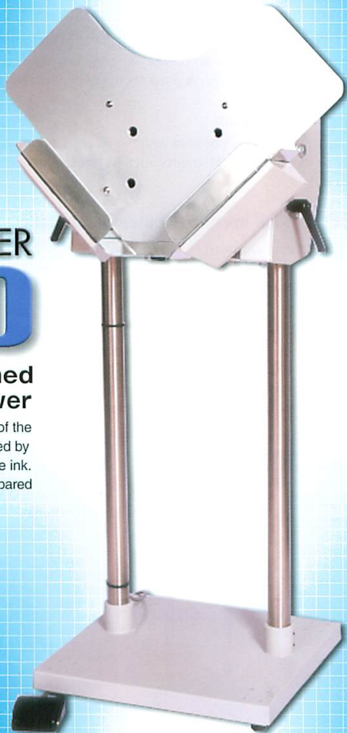
When A3 / Ledger size tray is used.