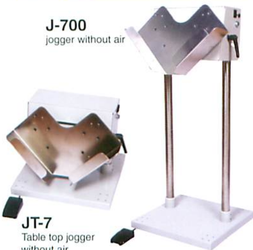
JT-7 Table top jogger without air