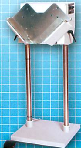
When A4 / Letter size tray is used.

Jogging time is significantly reduced by the effect of the air blower. Wet ink on printed papers is quickly dried by the air, thus preventing staining of the paper by the ink. See the effect and improvement in productivity compared with conventional joggers.