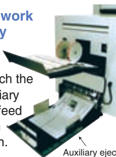
Auxiliary ejection tray

If a feed error of a double feed or an empty feed occurs when linked up to the collator, a collated papers to which the error occurred is ejected to the auxiliary paper ejection tray below. Even if a feed error thereby occurs, the system continues to run without interruption.